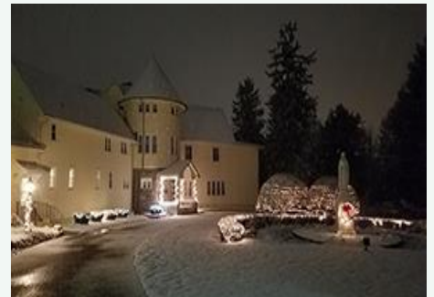
The Convent at Christmas time! The Sisters love to make everything Festive.

Christmas at St. Joseph's Nursing Home is truly special with our Polish Sisters. The decorations are spectacular and they make St. Joseph's a Home away from Home. We are so grateful for all of their hard work.