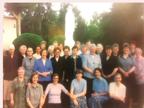
See any familiar faces?